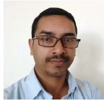
By: M.R. Lahu

In spite of the fact that the population policies, family planning and welfare programmes undertaken by the Govt. of India have led to a continuous decrease in the fertility rate, yet the actual stabilisation of population can take place only by 2050. More efforts need to make people aware about population issues like importance of family planning towards the increasing population, gender equality, maternal and baby health, poverty, human rights, right to health, sexuality education, use of contraceptives and safety measures like condoms, reproductive health, adolescent pregnancy, girl child education, child marriage, sexually transmitted infections and so many. World Population has witnessed a rapid growth in the last 200 years. Countries like China and India together constitutes 37% of the total world population. Population increase is taking away all the developmental results of our nation.